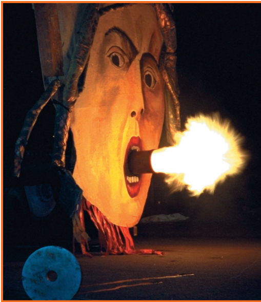
An SRL show put on in Seattle carried the title “A Carnival of Mismatched Devotion: Calculated to Arouse Resentment for the Principles of Order.”

In any given SRL show, up to two dozen large machines perform, each controlled by trained SRL technicians. Granted, the training might only last a day or two, but the technicians still take their jobs seriously. Wearing the prerequisite earplugs and sound-muffling headsets, they use radio controllers to manipulate the machines. “We build the controllers ourselves,” says Pauline. “There are lots of channels available, up to 30, and we use both the FM and AM band, together with PCM radios, to avoid interference