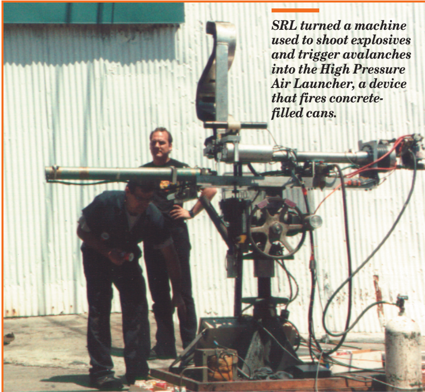
SRL turned a machine used to shoot explosives and trigger avalanches into the High Pressure Air Launcher, a device that fires concrete-filled cans.

• The Hand-O'-God is a giant spring-loaded hand mounted on a remote-controlled wheeled platform. The hand is made of several hollow metal cylinders that serve as fingers and are attached by steel cables to a set of giant springs. The hand weighs 1,500 lb and is cocked by an air-cylinder with 8 tons of pressure. When the springs are released, the hand flexes forward with a considerable amount of force. The hand