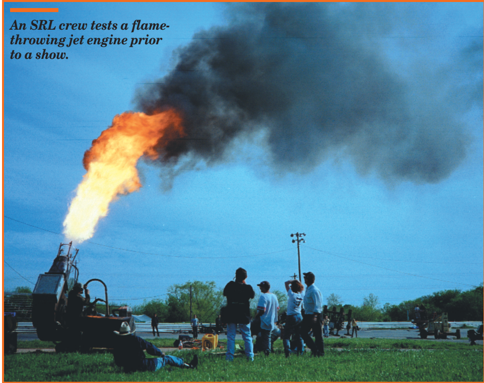
An SRL crew tests a flame-throwing jet engine prior to a show.

issues. We also use noise-resistant, custom-built boards inside metal enclosures to stop RF interference. Since we use them around huge Tesla coils and actually arc the coils to the machines themselves, we really need that protection.”