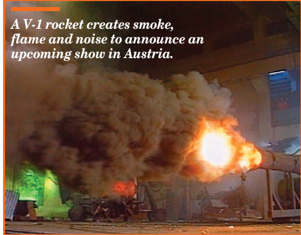
A V-1 rocket creates smoke, flame and noise to announce an upcoming show in Austria.

on machines with legs," recalls Pauline. "Peak loads make the linkages fail and limit the speed the legs can move. So I came up with this chain drive. It's reliable, runs for hours, and because the chains are strong, it's efficient. Plus, if the chain breaks, it's easy to get another one. It's not a complicated linkage that takes weeks to machine."