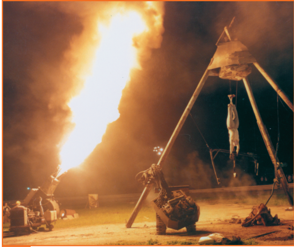
A flamethrower and several smaller SRL machines perform in the show “The Unexpected Destruction of Elaborately Engineered Artifacts: A Misguided Adventure in Risk Eradication, Happening Without Known Cause, in Connection With Events That Are Not Necessarily Related.”

He added heavy copper rails, fiddling with their length and width to focus the magnetic field in the barrel of the device. He wanted the field to force the metal into a tight ball. Eventually he came up with a design that uses an air cylinder to slam high-