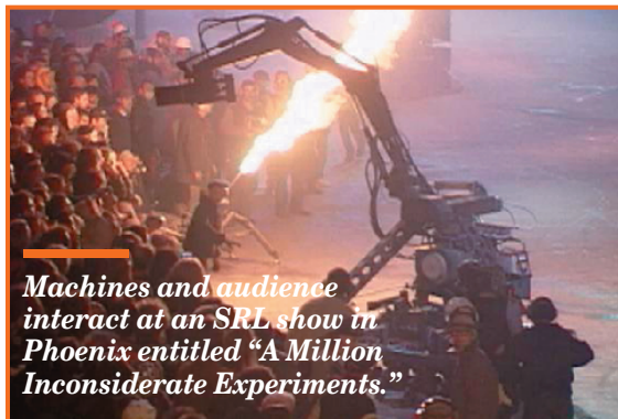
Machines and audience interact at an SRL show in Phoenix entitled "A Million Inconsiderate Experiments."