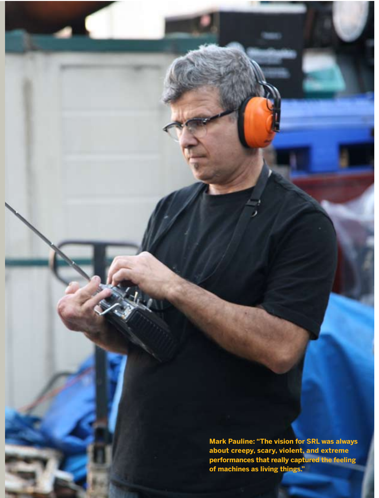
ILLUSTRATION BY DUSTIN AMERY HOSTETLER

Mark Pauline: "The vision for SRL was always about creepy, scary, violent, and extreme performances that really captured the feeling of machines as living things."