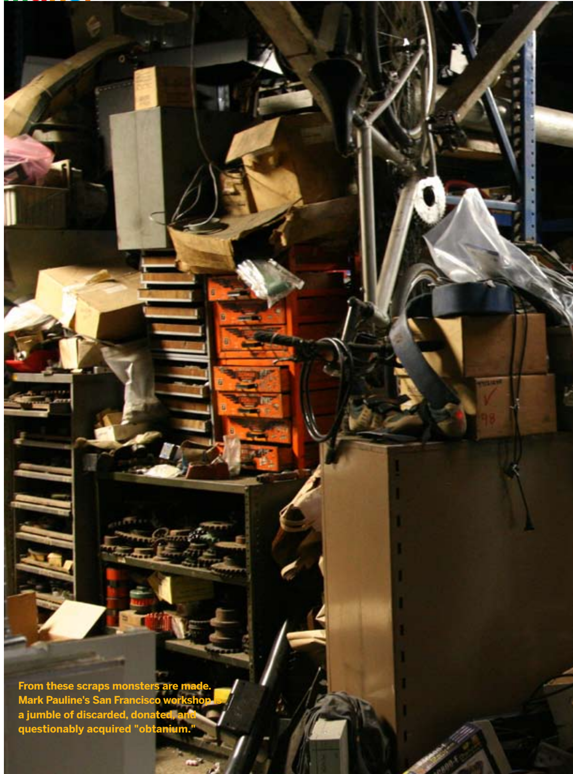
From these scraps monsters are made. Mark Pauline's San Francisco workshop is a jumble of discarded, donated, and questionably acquired "obtanium."

Outfitted with flamethrowers, the radio-controlled, monster-sized walking machines torch piles of broken pianos as a 16-foot Tesla coil spurts crackling blue sparks. A huge air cannon blasts away at plate glass